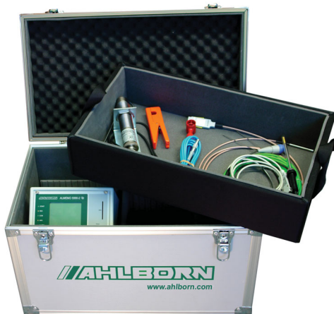
Carry case, universal, high, aluminum profile frame for ALMEMO® 5690-1M/-2M Order no. ZB5600TK3

The old MU connector version, ZA5590MU, can of course be used in conjunction with the old ALMEMO® 5590/5990 systems but is subject to certain restrictions with the current 5690 systems (e.g. only 1 measuring channel per input, no multi-point adjustment or connector linearization).