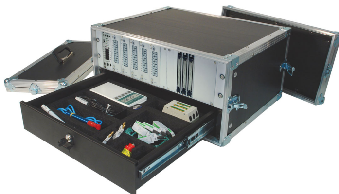
Rack case with carrying handle, for ALMEMO® MA5690xxBT8 measuring systems, in 19-inch sub-rack Order no. ZB5090RC