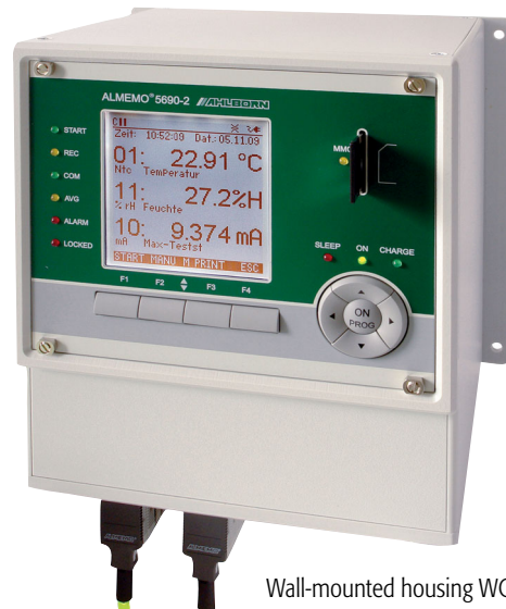
Wall-mounted housing WG3

Technical features common to all ALMEMO® 5690-1M09 and 5690-2M09 systems see catalog, ALMEMO® 5690-1M09